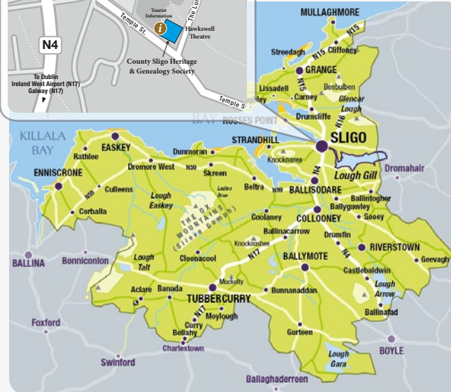
Map of County Sligo

The county Sligo Heritage & Genealogy Centre offices are located in the Regional Tourism Headquarters at Temple Street, which is adjacent to the Sligo Catholic Cathedral.